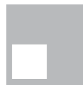
3.5" x 3.5"