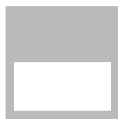
7.5" x 3.5"